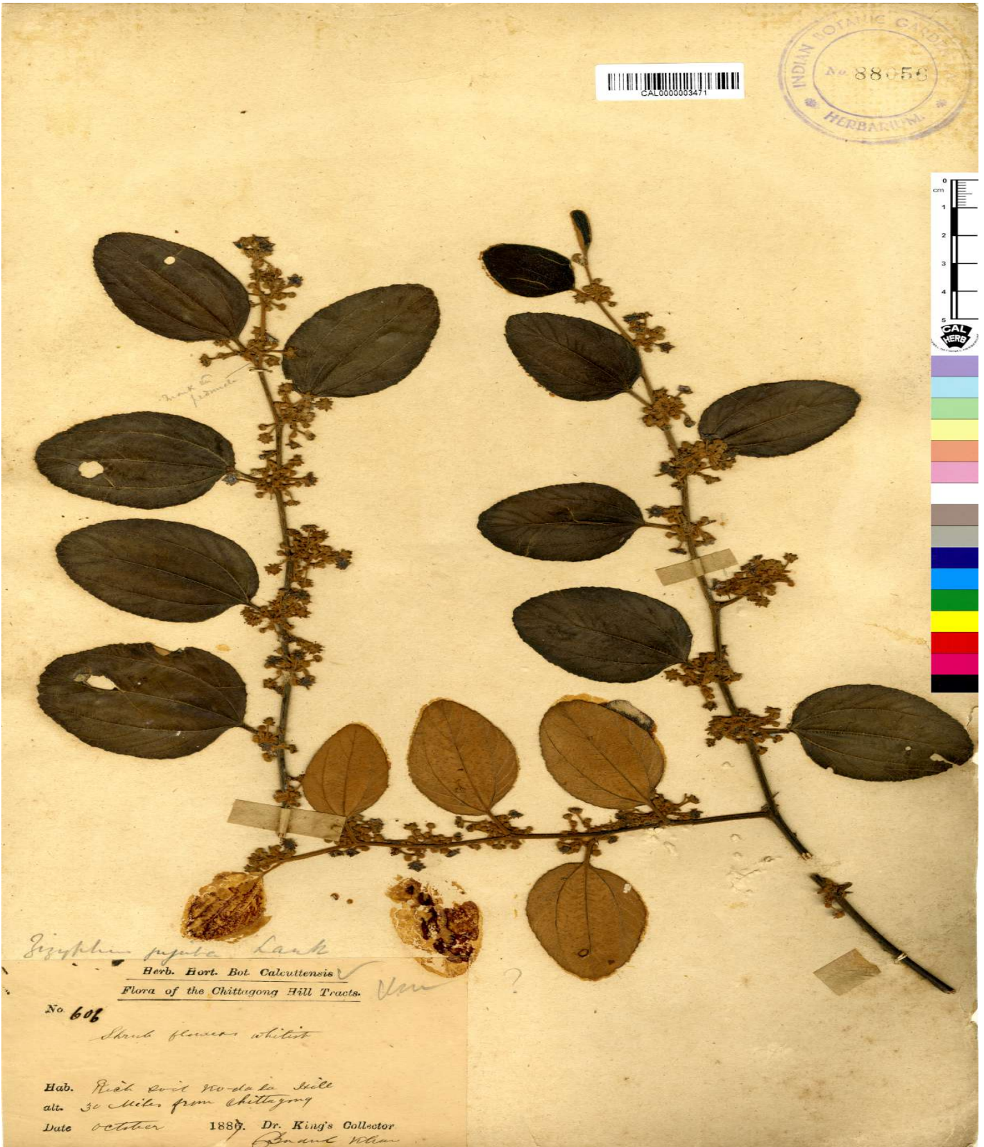
Image Details of Economy Botany Herbarium