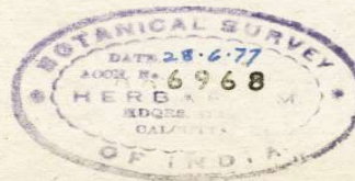
Image Details of Economy Botany Herbarium