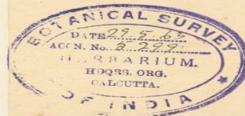
Image Details of Economy Botany Herbarium