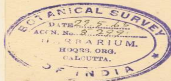
Image Details of Economy Botany Herbarium