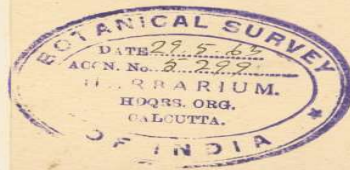
Image Details of Economy Botany Herbarium