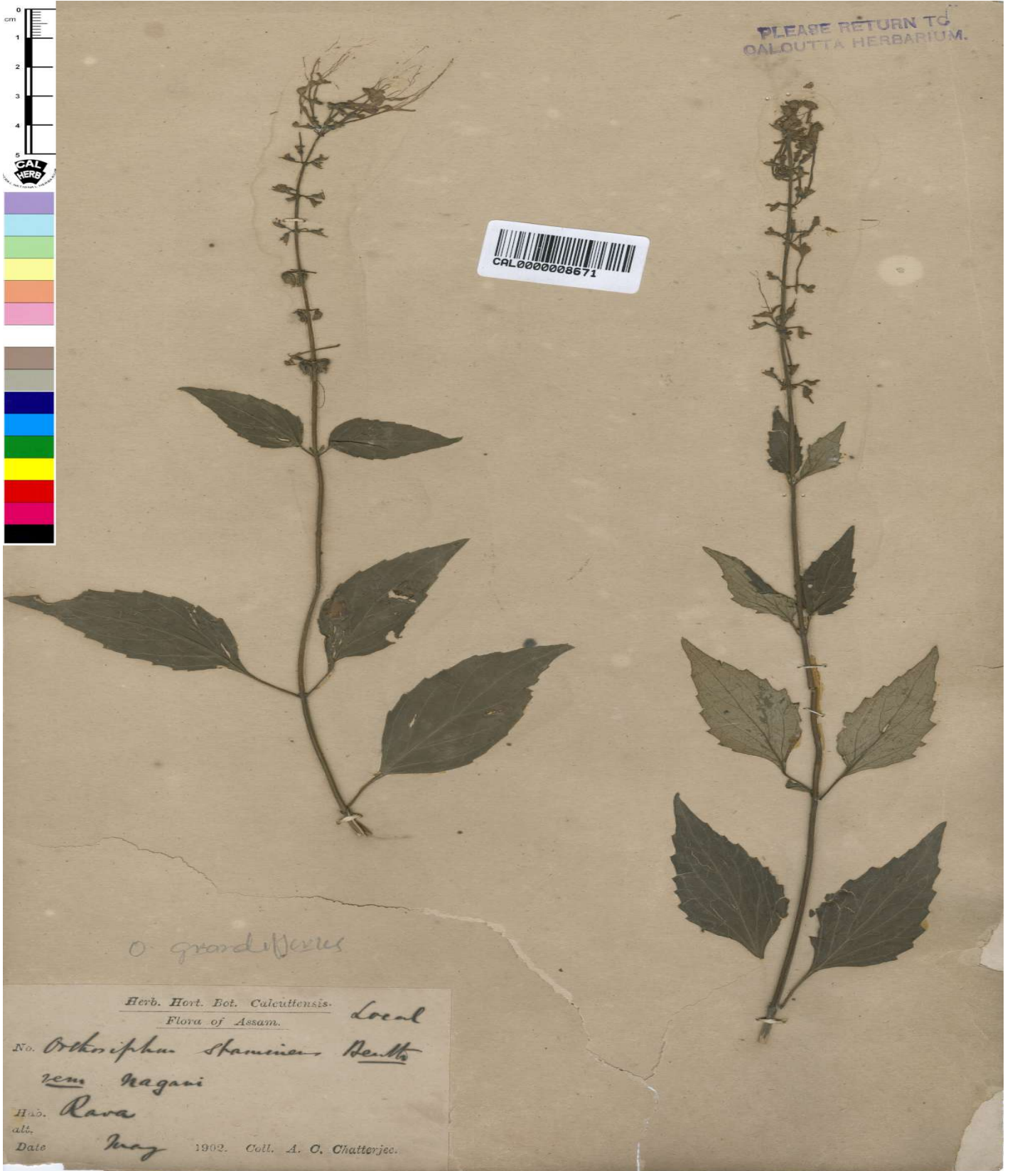
Image Details of Economy Botany Herbarium