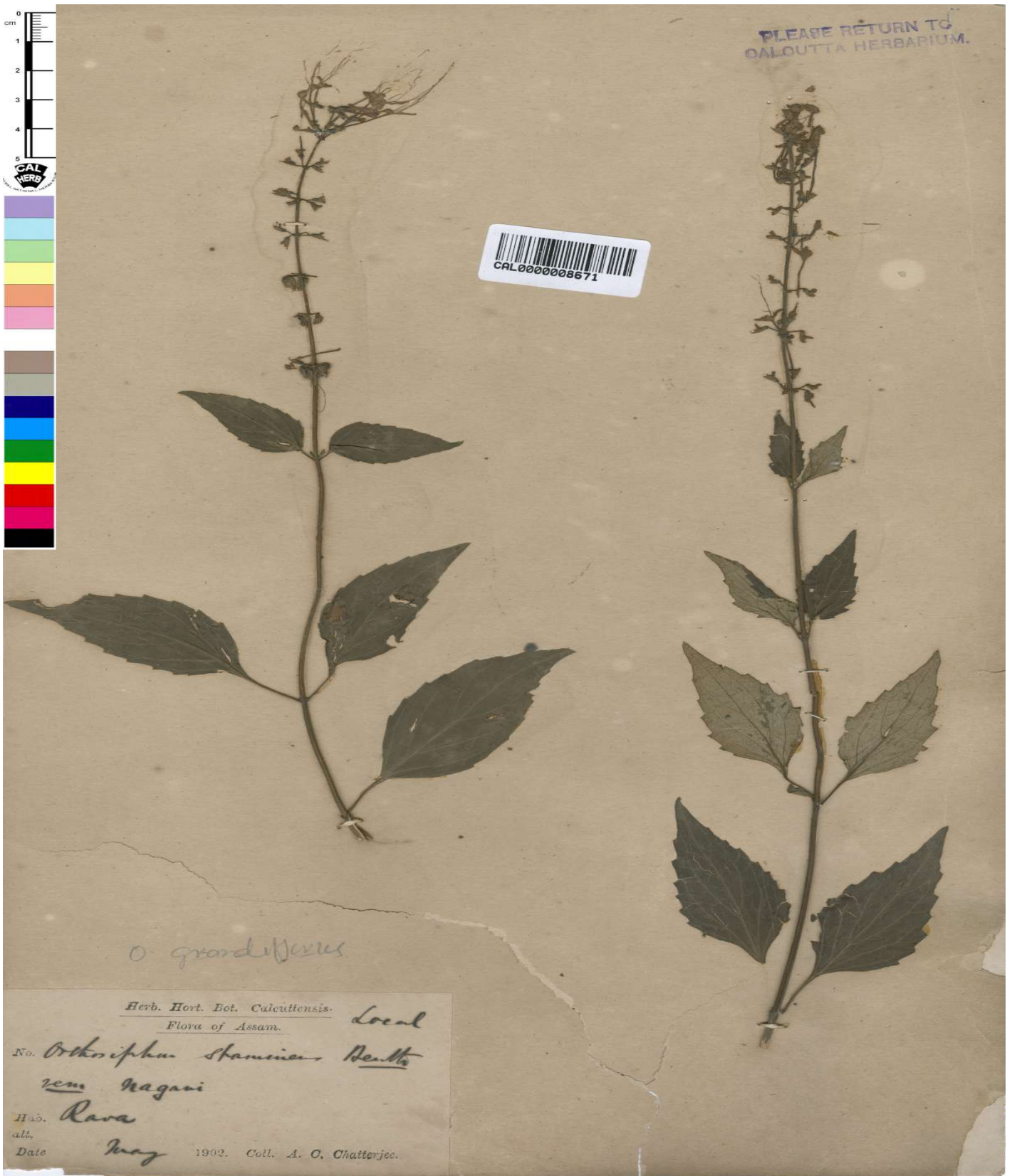
Image Details of Economy Botany Herbarium