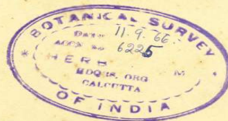
Image Details of Economy Botany Herbarium

Prostrate herb on sandy shores and adjacent cultivated fields along the Mahanadi River. Occasional fruiting.